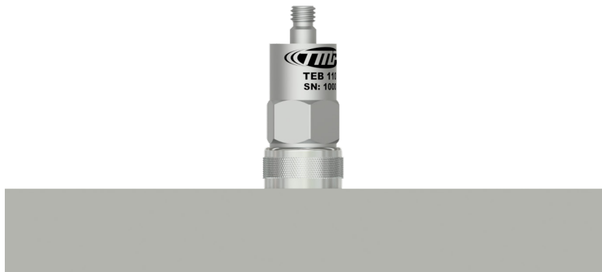
Figure 3. Magnetic Mounted Sensor