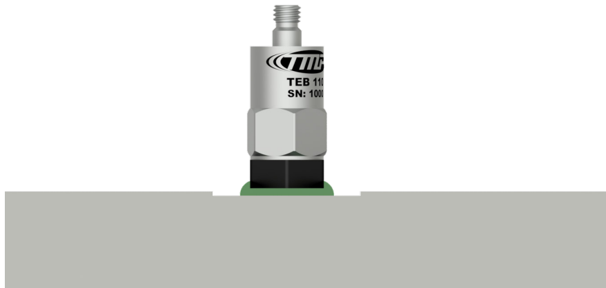
Figure 2. Adhesive Mounted Sensor