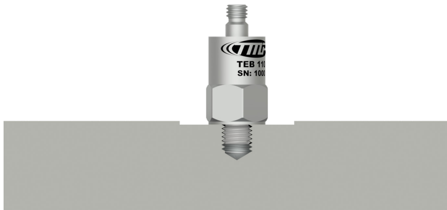
Figure 1. Stud Mounted Sensor